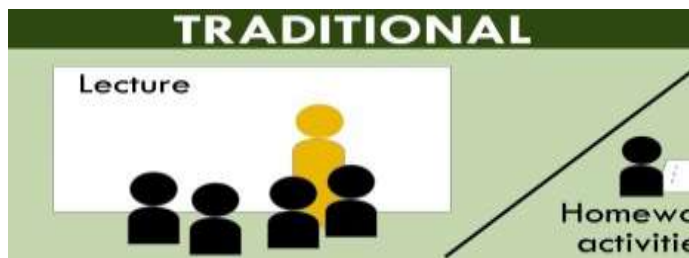
Fig. 1: Pictorial Concept of Traditional Learning Method

Various teaching methods like traditional lecture, discussion, project based are discussed in the literature (Farashahi & Tajeddin, 2018; Usarov, 2019; Yusupov, 2020). The most useful teaching strategy to increase the critical thinking is the small group discussion teaching method as concluded by the various studies (Bidabadi et al. , 2016; Yli-Panula et al. , 2018; Sivarajah et al. , 2019; Strubbe et al. , 2020). The traditional lecture method is a one-way conversation in which an instructor delivers the information before the audience (Gholami et al. , 2016). After the lecture, the instructor gives notes and assign some tasks as homework (Gregorius, 2017). In traditional lecture teaching methods, no feedback session for the learners is conducted (Almanasef et al. , 2020). Generally, very little conversation happens between the learners and instructors (Sarihan et al. , 2016). The learners receive passive strategy of learning (Maqbool et al. , 2018). The Pictorial view of Traditional learning is shown in Fig. 1.