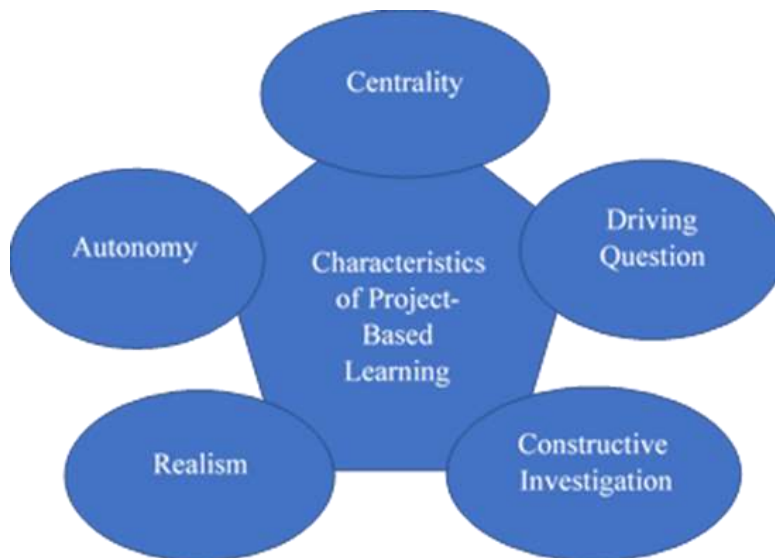
Fig. 3: Characteristics of Project-Based Strategy